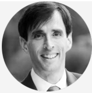
Mayor Noam Bramson Mayor City of New Rochelle